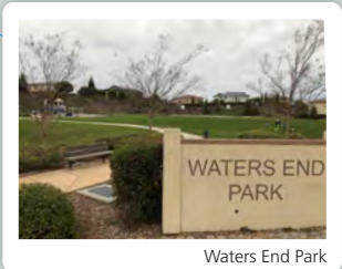
Waters End Park