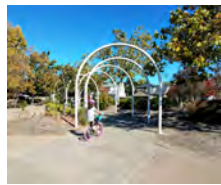
Jack London Park