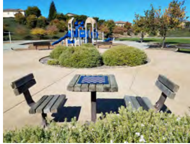
Waters End Park