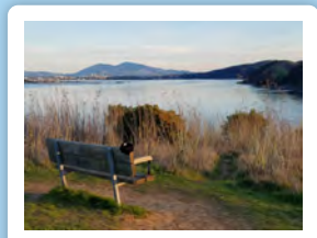
Looking east to Mount Diablo