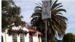
Peabody Hospital site (1849)