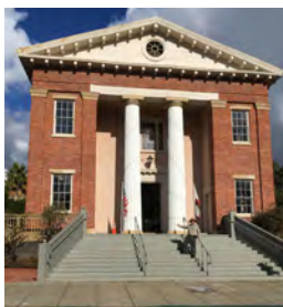
State Capitol (1852)