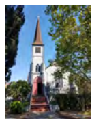
St Paul's Church (1859)

please use caution on pedestrian pathway dismount bicycle if necessary