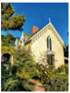
Frisbie-Walsh House (1850)