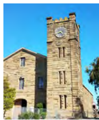
4 Clock Tower (1859)

Difficulty Moderate Distance 4.5 Miles Type Loop Time 35 minutes