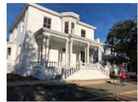
3 Commanding Officer's House (1860)

to continue on Jefferson Street dismount and walk bike through passageway or drop down to Adams Street to continue on route