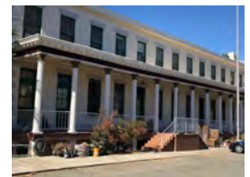
6 Bachelor's Quarters (1872)