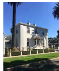
2 Jefferson Street Mansion (Lieutenant's House)(1863)