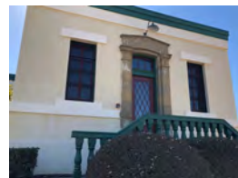
5 Guard House (1872)